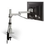
Integrated cable management