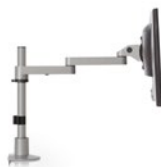
Focal depth adjustment