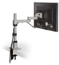
Integrated cable management