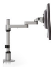
Focal depth adjustment