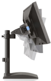
Wide range of monitor tilt