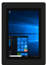
Landscape or portrait orientation