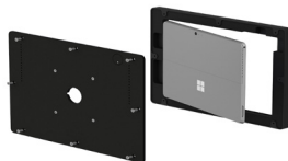
Fast and easy installation