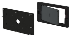
Fast and easy installation