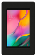
Landscape or portrait orientation