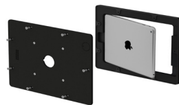
Fast and easy installation