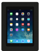
Landscape or portrait orientation

62956-AIR-BLK: Home button and camera access 62956-AIR-HRC-BLK: No home button and camera access